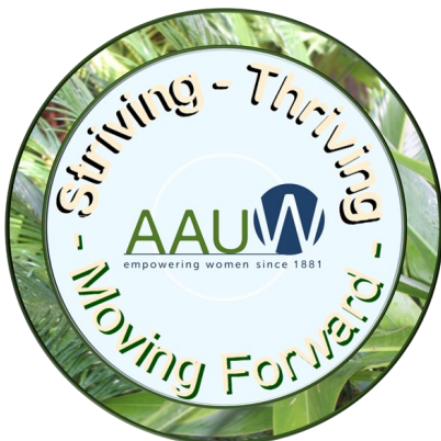
AAUW Iowa - State Conference - April 8 & 9, 2022

Directions: The reservation link is designed for making a reservation for Thursday, April 7; Friday, April 8; and (or) Saturday, April 9. After clicking on the link, click on Book a Room . Then you must click on “edit stay” (right of center at top) to indicate which night(s) you will be staying. Most of our members will be staying on Friday night in order to be on site for the 8:30 meeting on Saturday. Be sure to edit your stay to avoid being charged for all three nights.