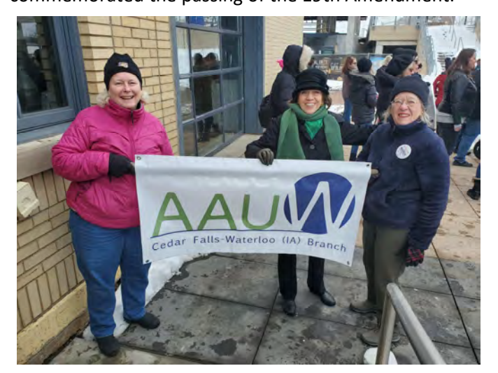
Members of the Cedar Falls-Waterloo Branch

The Black Hawk County chapter of the National Organization for Women, together with Northern Iowa Feminists, One Iowa, Americans for Democratic Action, and AAUW Cedar Falls-Waterloo and Waverly branches. organized the first Women's March in the Cedar Valley on January 25, 2020. The march in Waterloo was a call to action to support legislation that benefits women and minorities. It celebrated women and minorities and commemorated the passing of the 19th Amendment.