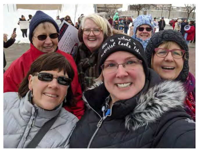
Members of the Waverly branch

Participants marched for ratification of the ERA, for pay equity, and for comprehensive rights for the LGBTQ community. They marched for access to reproductive rights, to end violence against women and other marginalized groups, and to fight discrimination based on sexual orientation and gender identity. Attendees said that over 100 women participated, and great speakers talked to the group afterward.