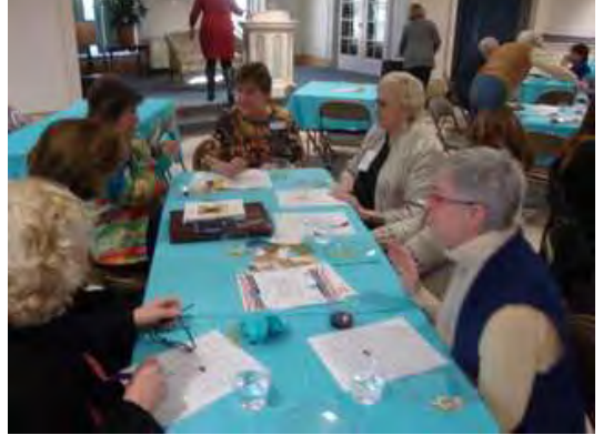
NUDGE attendees at the Waterloo YWCA

NUDGE is an acronym, standing for No Use Delaying Gender Equity.