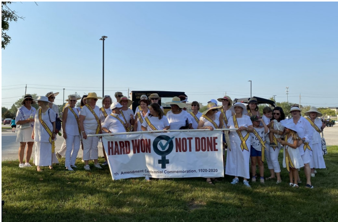
Marchers posed for a photo before the parade.

States to vote shall not be denied or abridged by the United States or by any State on account of sex." Early suffragists decorated a milk delivery wagon with slogans and used it to sell copies of The Women's Journal, a publication of the American Women's Suffrage Association. The wagon in the parade is a replica of the original suffrage wagon used by Lucy Stone from 1913-1920, now in the Smithsonian.