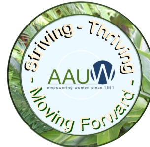
AAUW Iowa - State Conference - April 8 & 9, 2022

conference. Please use this link to give us your opinions by September 17: https://forms.office.com/Pages/ResponsePage.aspx?id=Zz0YCDk-hEaa3sY-MTzbCY2tbgH-K85lhI4Y1t4sJ3FUNTRFREpBN01ONjkzT1M3RVNZOTRDQTZOV i4u