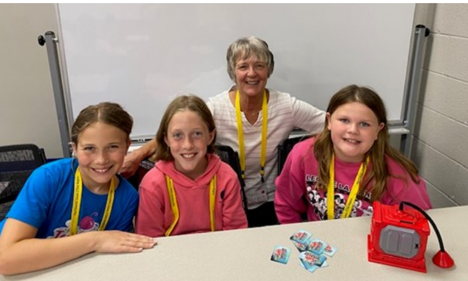
Lower right—A student works on navigating a drone.